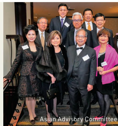
Asian Advisory Committee