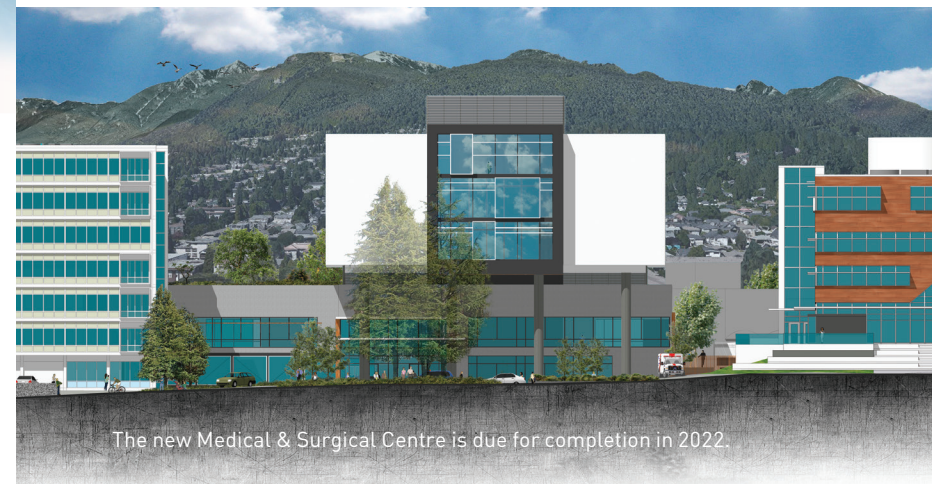
The new Medical & Surgical Centre is due for completion in 2022.