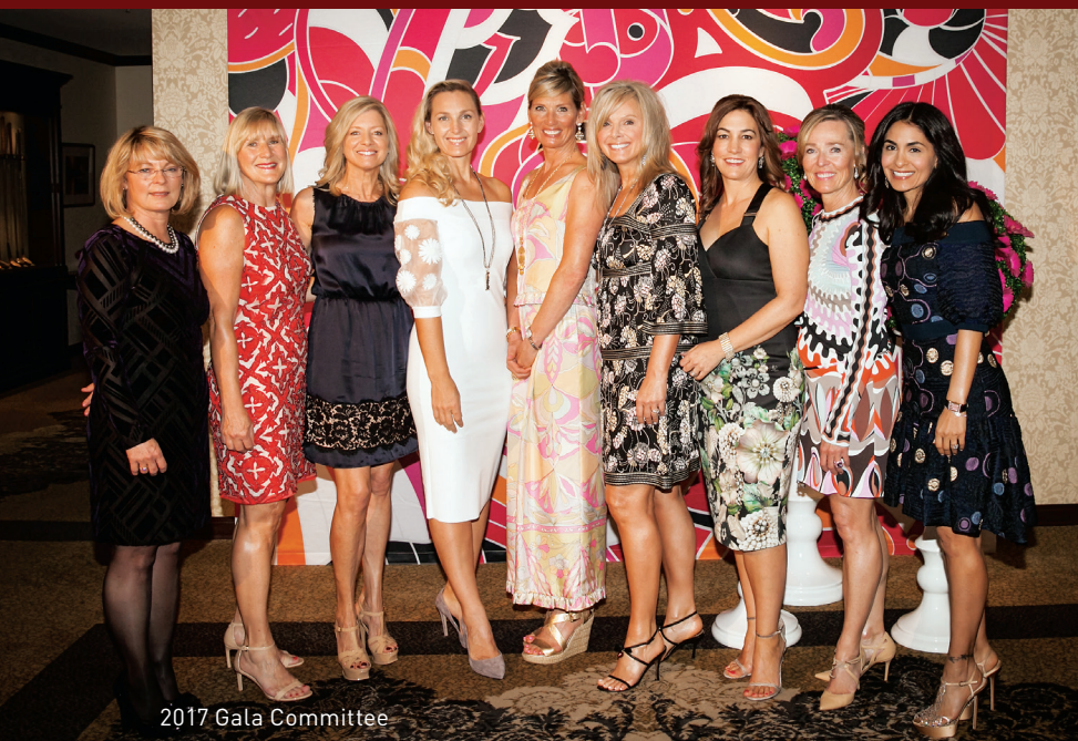
2017 Gala Committee

THE SMILES WERE AS BRIGHT as the Pucci decorations at the 17th Annual Lions Gate Hospital Gala held at the Capilano Golf & Country Club in May.