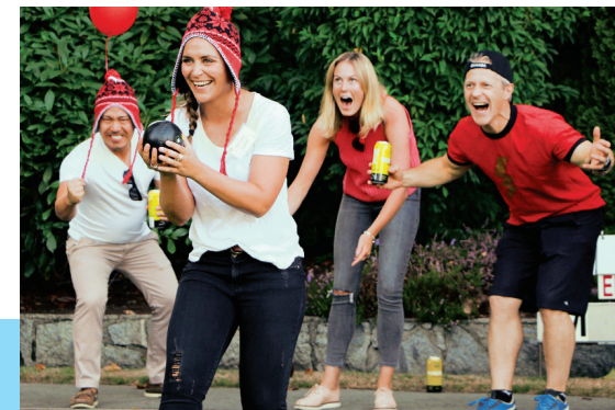
The Young Professionals Committee put on a lawn bowling tournament in August (above), while YAC hosted a car wash and bake sale in May (left).

Members of the Youth Advisory Committee (YAC), made up of undergrads and secondary-school students, are working hard to emulate that success. In recent years the committee has raised close to $10,000 through spring and Christmas fundraisers.