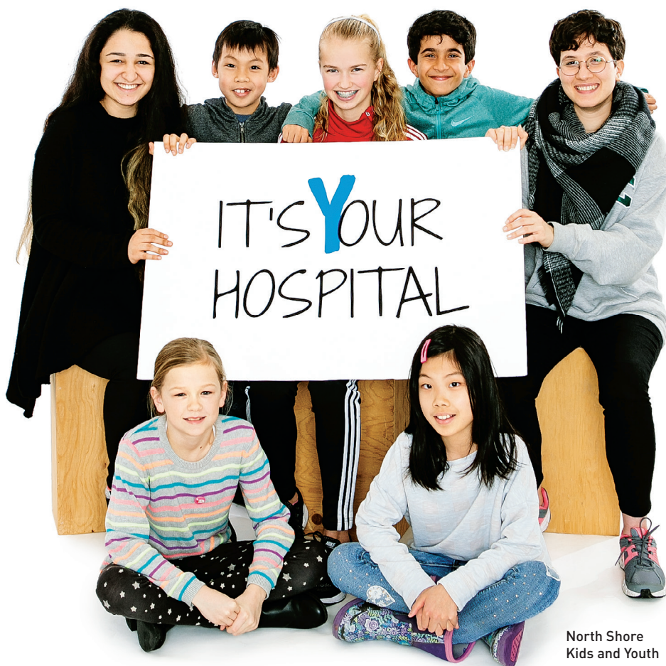
North Shore Kids and Youth