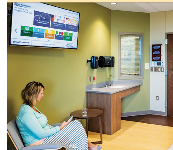
The MSC will allow patients more privacy.

Patients don't necessarily need a robot in every room but there is definitely a need for lots of computer