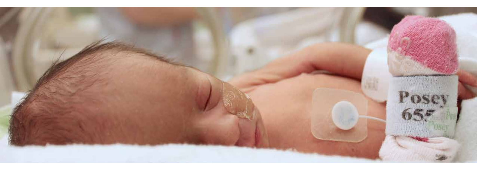
Up to 1,400 babies a year are born at LGH and each one requires a jaundice test.

SPRING 2019 / BRINGING LIFE-CHANGING CARE TO THE NORTH SHORE