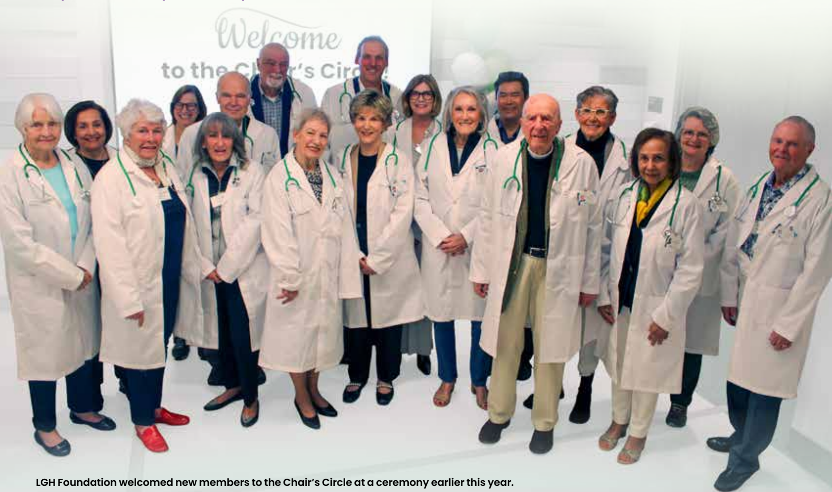
LGH Foundation welcomed new members to the Chair's Circle at a ceremony earlier this year.

The spirit of philanthropy burns bright within every one of our Chair's Circle Members. Lions Gate Hospital Foundation celebrates their exceptional generosity which has a deep and enduring impact on many areas of patient care at LGH.